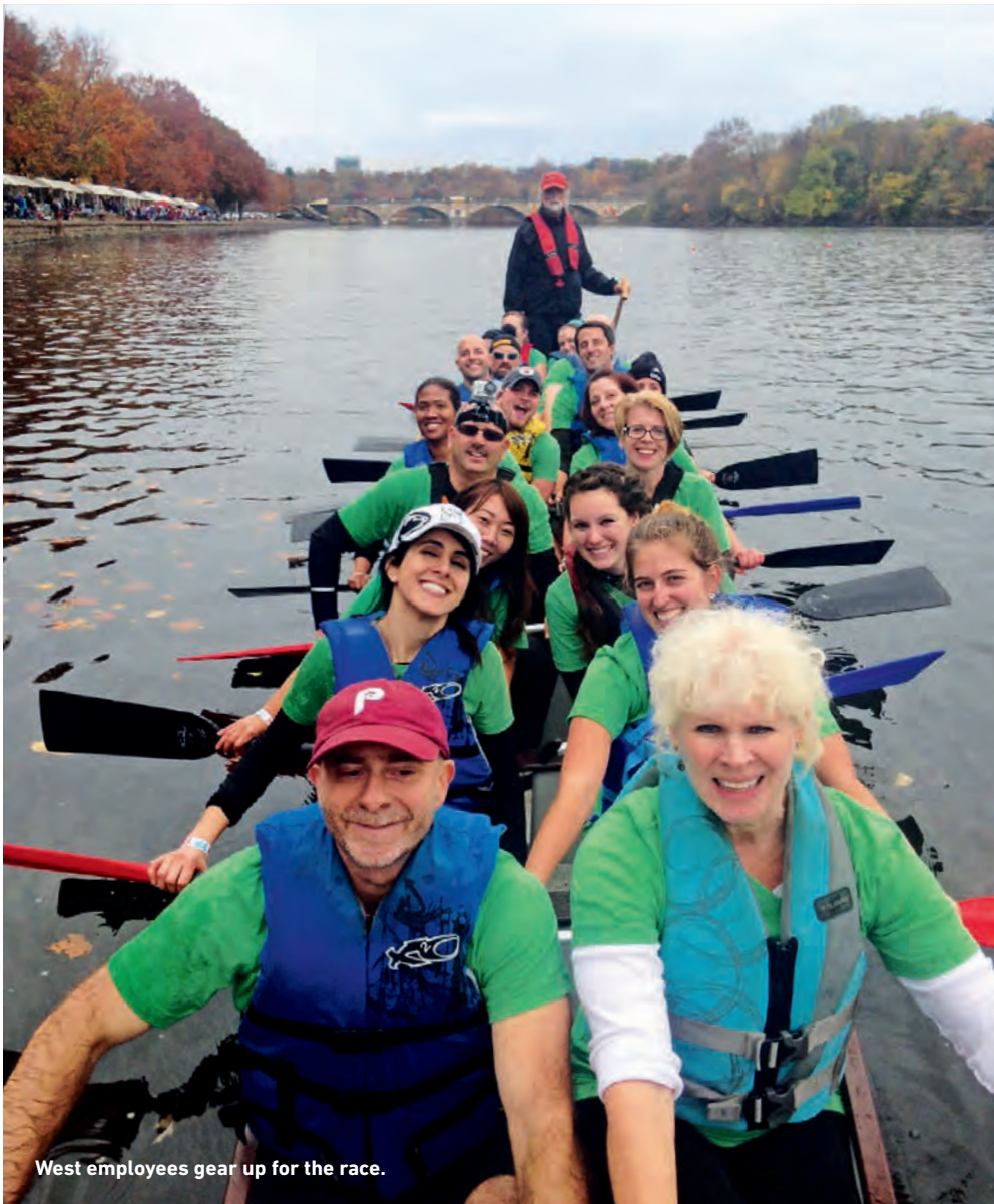
West employees gear up for the race.

West Without Borders, the company's global employee giving program, has donated millions of dollars to various organizations around the world that focus on aiding cancer research and care; science, technology, engineering,