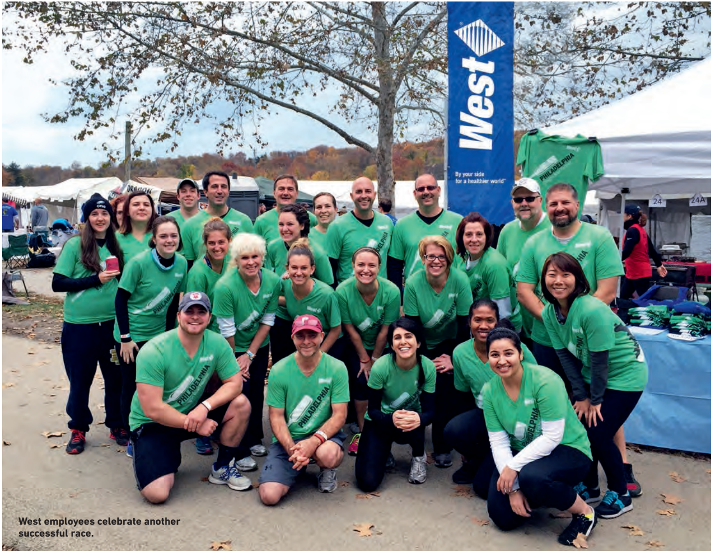
West employees celebrate another successful race.