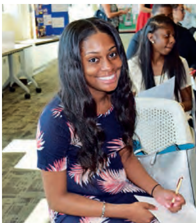
Above and top right: Students from Palumbo High School and Abraham Lincoln High School. Bottom right: Student presentations.

The Immersion Science Program hosts a number of events, training courses, and programs for both students and teachers, such as the Immersion Science Teachers Program. This program